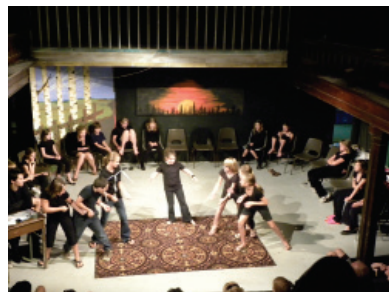
Preparing for a Tug of War