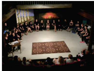
August, 2010. The stage is set