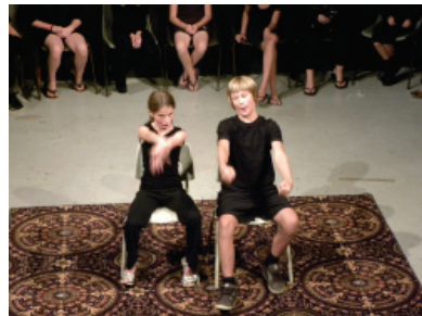
The taxi driver mimics the passenger